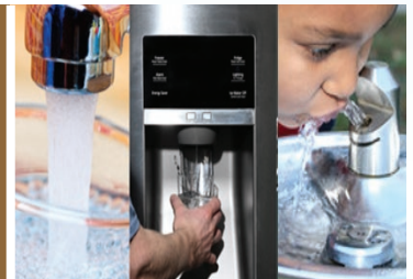
Tap | Fridge | Fountain

A growing number of businesses are turning to bottleless drinking water systems for their advanced filtration capabilities, providing purified, healthy, and unlimited drinking water.